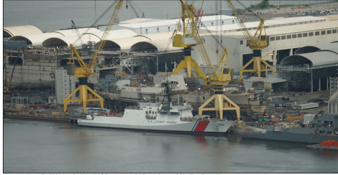
Image: Ingalls Shipvard at Port of Pascagoula

Key state and regional recommendations center around continued collaborative planning among local, state, tribal, and federal entities, non-governmental organizations to address existing and future coastal storm risks. Regional and state findings reaffirmed the need and support of the recommendation in Mississippi Coastal Improvements Program that address long-term risk reduction and community/environmental resiliency within the three coastal counties of Mississippi. Several recommendations also focused on continued regional sediment management (RSM) and beneficial use of dredged material strategies to support economically sustainable and environmentally acceptable solutions to reduce coastal risk.